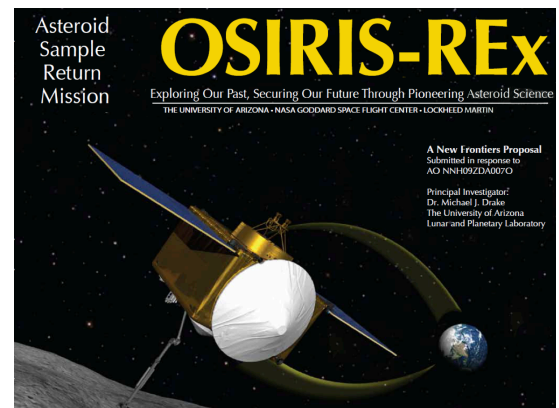
OSIRIS-REx mission sampling the asteroid 1999RQ36 (in 2020)